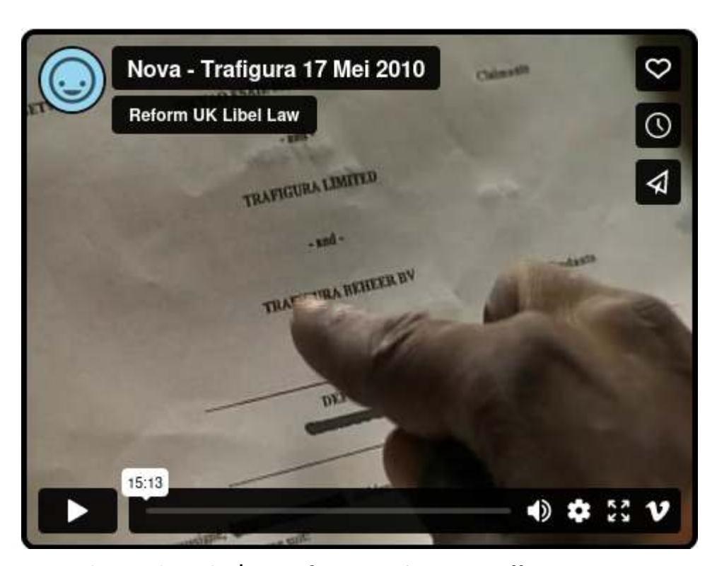
Vimeo (download) | Trafigura drivers: "We were bribed"

Vimeo commenter: 'Thank you, whoever you are, for making this available. As you know here in the UK we're not allowed to read or see any of this.'