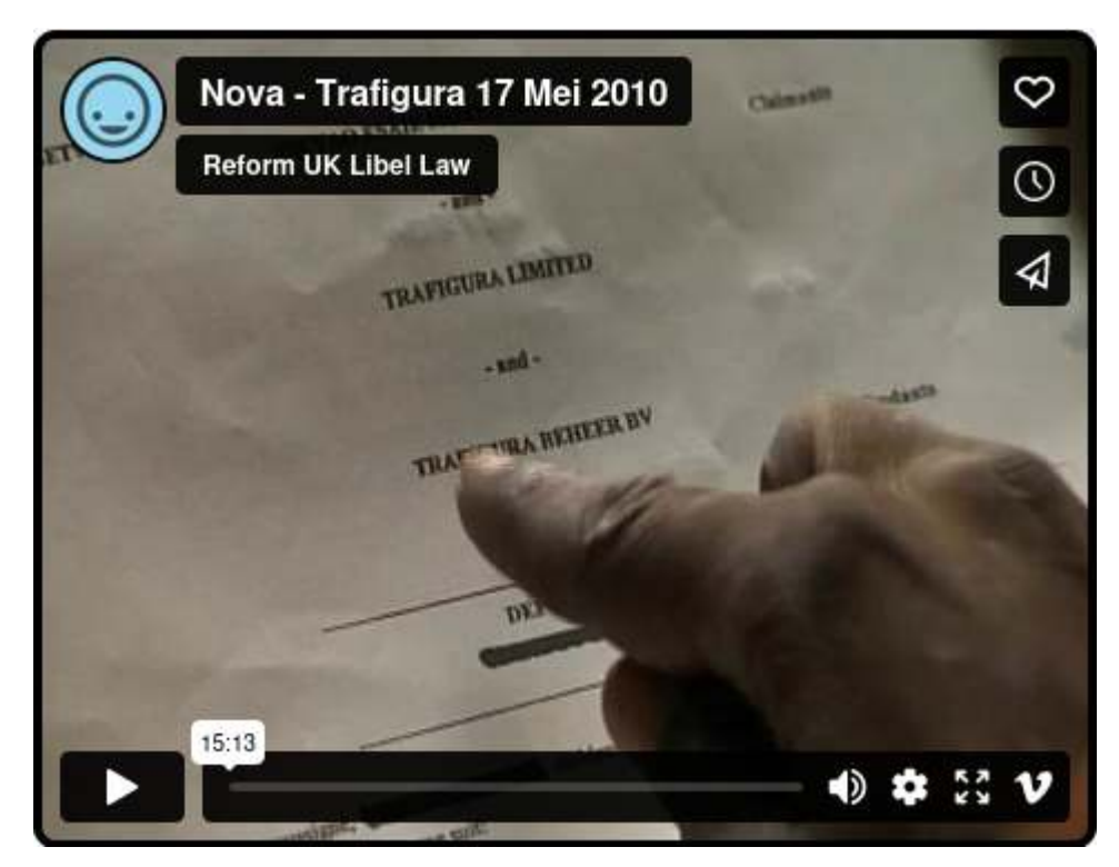
Vimeo (download) | Trafigura drivers: "We were bribed"

Vimeo commenter: 'Thank you, whoever you are, for making this available. As you know here in the UK we're not allowed to read or see any of this.'