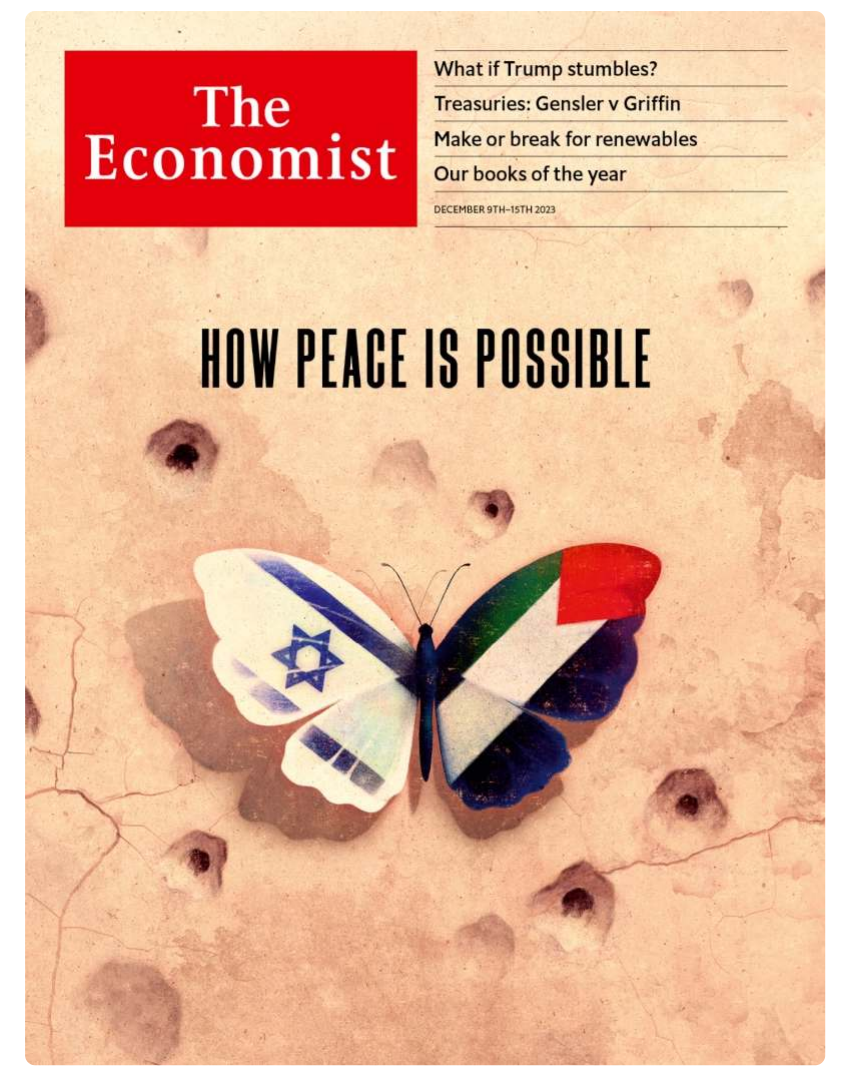
Israel and Palestine: How peace is possible